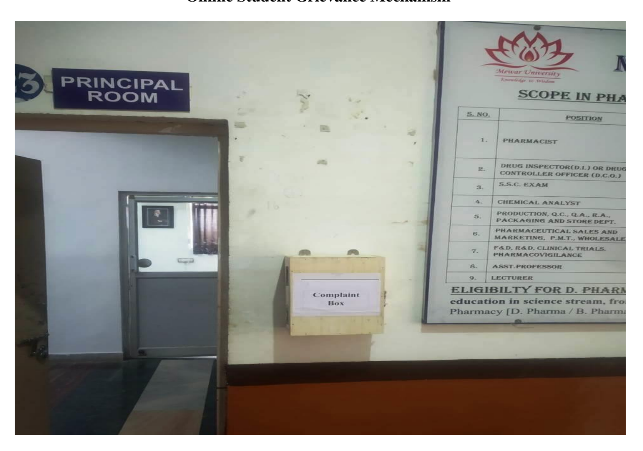
Offline Student Grievance Mechanism