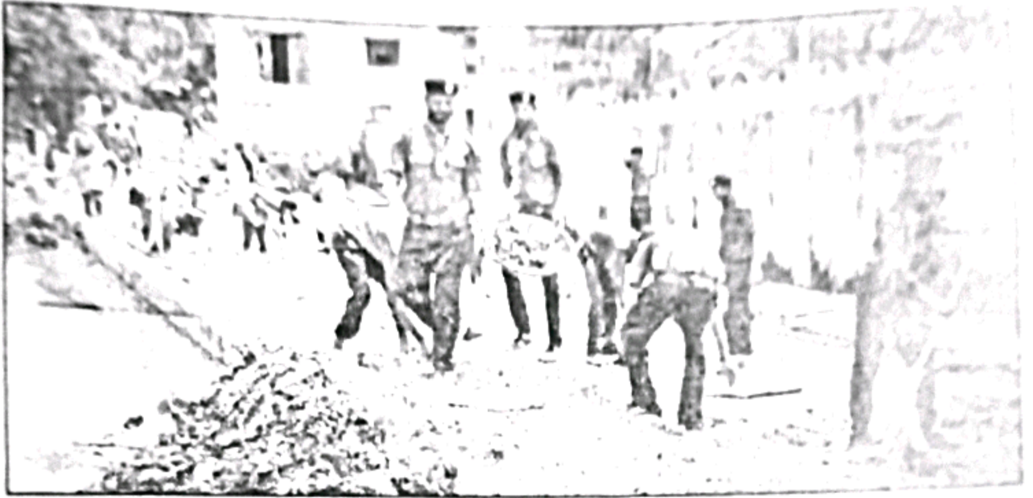
चित्तौड़गढ़। दुर्ग मार्ग पर सफाई करते रोवर रेंजर्स।