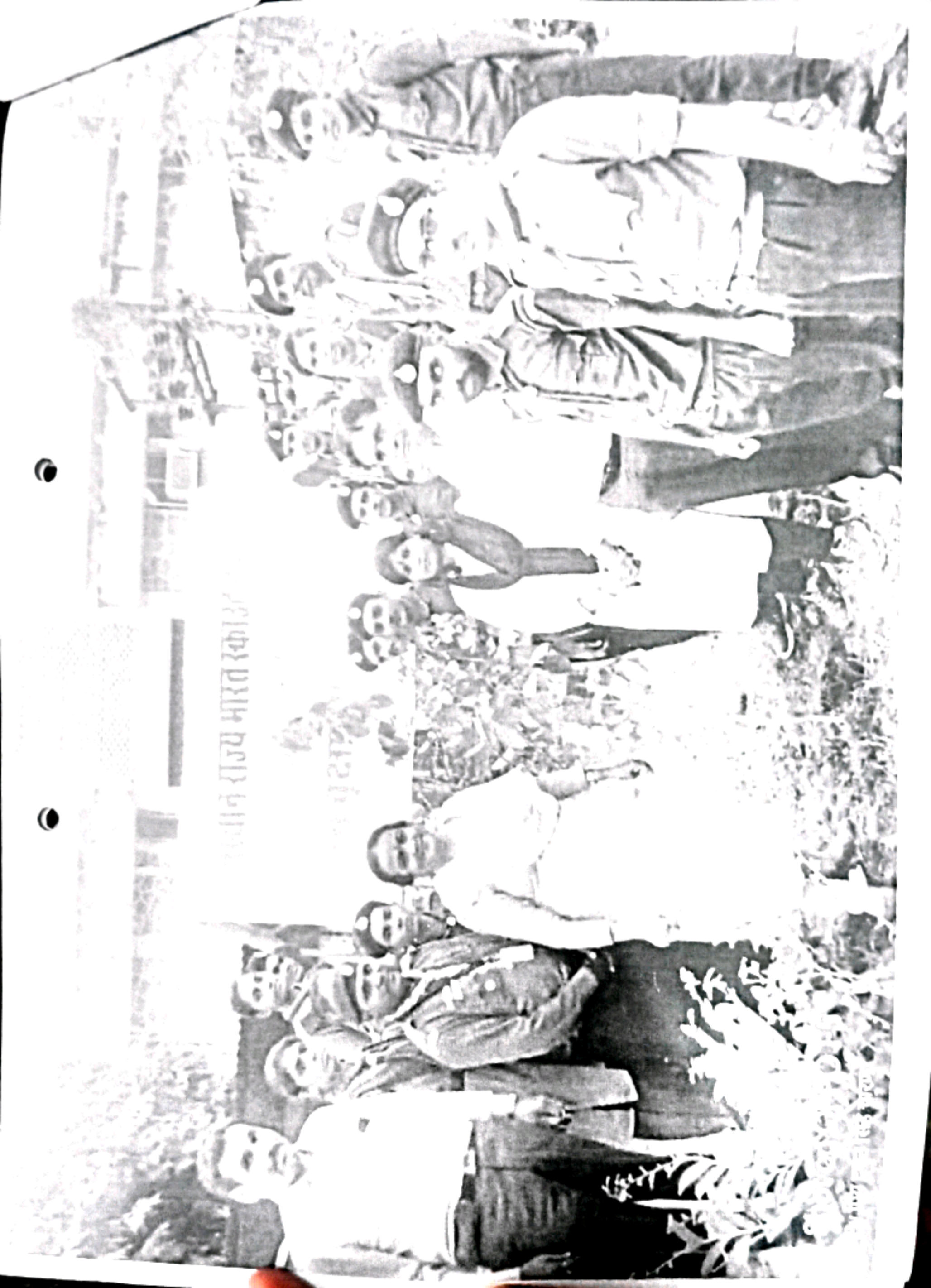
பெரிய பள்ளி கல்வியறிவு