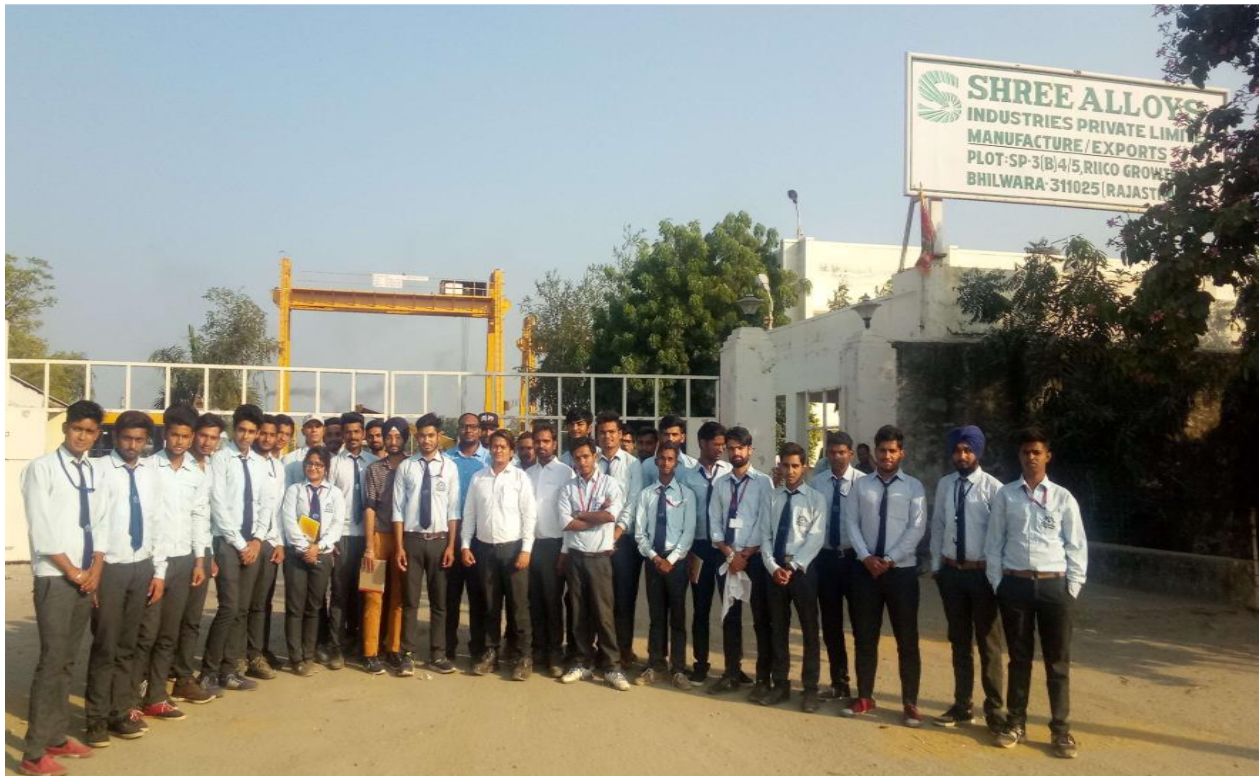
LIST OF STUDENTS FOR INDUSTRIAL VISIT AT SHREE ALLOYS LTD BHILWARA RAJASTHAN