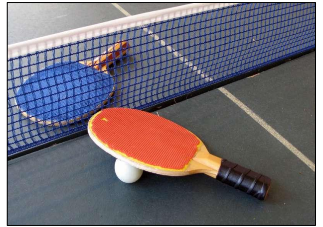
Table Tennis – the less hectic sister sport of lawn tennis